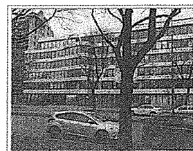
Headquarters of MAN SE in Munich

On 6 June 2012 Volkswagen AG announced that it had increased its share of voting rights in MAN SE to 75.03%, paving the way for a domination agreement to be put in place. [22]